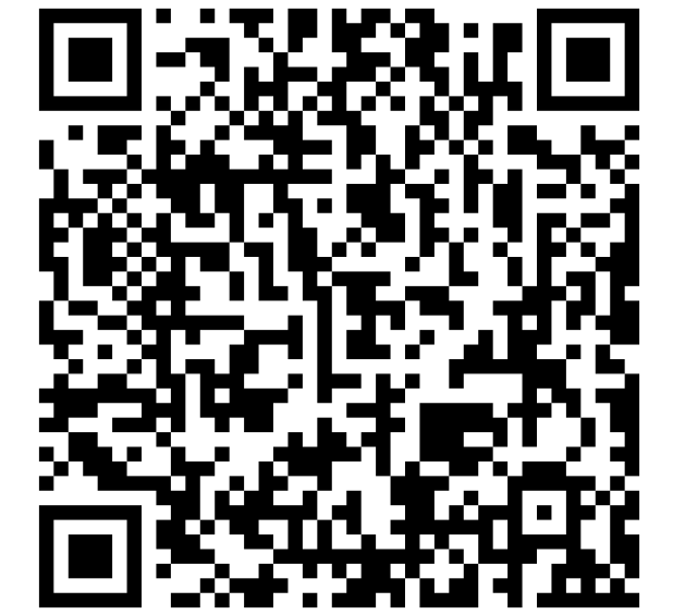
SCAN BARCODE 3D VIRTUAL TOUR